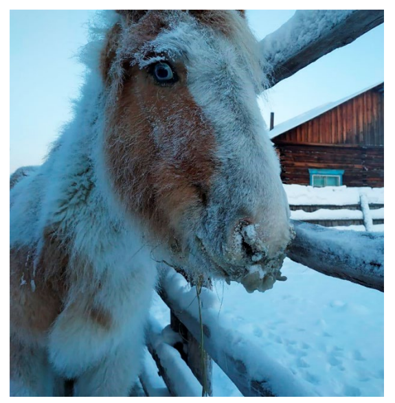
Fig. 1. Mucopurulent nasal discharge of a Yakut breed foal ( Equus ferus caballus ) showing clinical signs of stranglers (Khangalasski District, village Nemyugyuntsy, 2017).

The 16S rRNA gene was sequenced at Genomika (Institute of Chemical Biology and Fundamental Medicine, Siberian Branch of the Russian Academy of Sciences, Novosibirsk). A ~ 1500 bps amplicon was produced using specific 16S primers (27F: 5'-AGAGTTTGATCMTGGCTCAG-3' and 1492R: 5'-GGTTAC-CTTGTTACGACTT-3') for each isolate in a preparative amount, then purified by sorption on magnetic particles (Agencourt AMPure XP, Beckman Coulter, Inc., USA). Sanger sequencing was run on an ABI 3130xl Genetic Analyser (Applied Biosystems, USA) per the manufacturer's standard protocols. Nucleo-tide sequences were BLAST-analyzed (https://blast.ncbi.nlm.nih.gov/Blast.cgi) to identify homology with nucleotide sequences deposited in the GenBank (https://www.ncbi.nlm.nih.gov/genbank/).